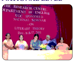
The Research Dept. of English organized a National Seminar on Literary Theory (December 16 & 17,2011).