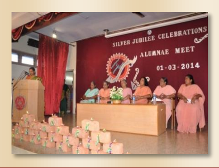
HIGHLIGHTS OF THE DEPARTMENTS IN EXTENSION ACTIVITIES

The Department of Computer Science organised Silver Jubilee Alumnae Meet on 1.3.2014. The former Principals were honoured and felicitated.